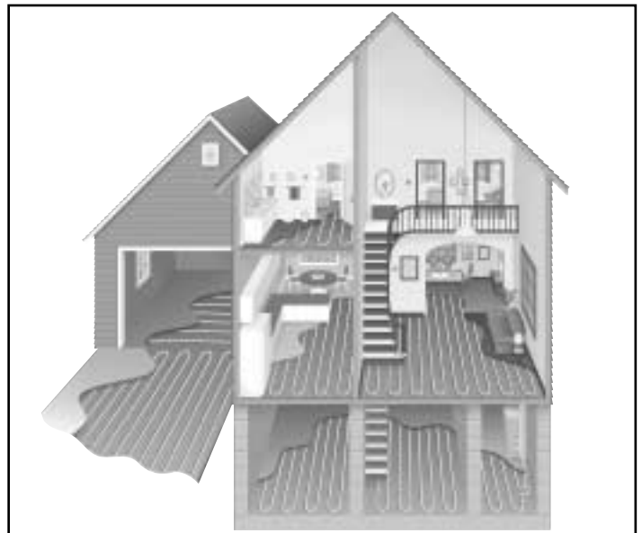
Illustration provided by Uponor Wirsbo

Polaris works great for homeowners who prefer radiant hydronic heat. With radiant floor hydronic systems, potable hot water is circulated through tubes under the floor. The floor absorbs heat from the tubes and radiates it into the room. With radiant baseboard heat, potable hot water is circulated through finned tube baseboard. Heat rises from the baseboard heaters, warming the home. All water components must be approved for use with potable water.